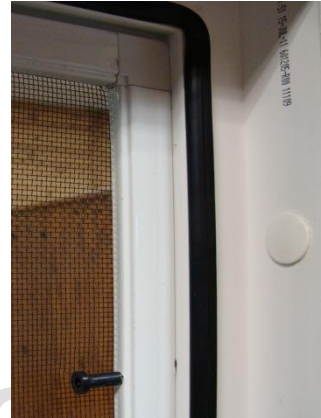
Figure 19: Installation hole (left), and with cover (right)