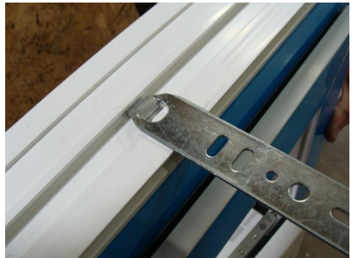
Figure 21: Installation strap

The sill should also be secured against movement. One method of doing this is to use installation straps (Figure 21) spaced out so the maximum distance between the straps is 28". Alternatively, if the distance from the sill to the rough opening is not too great, one of the innermost-screws may be removed from all of the lock strikes along the sill, and replaced with a #8 x 3" screw. WASCO recommends SPAX