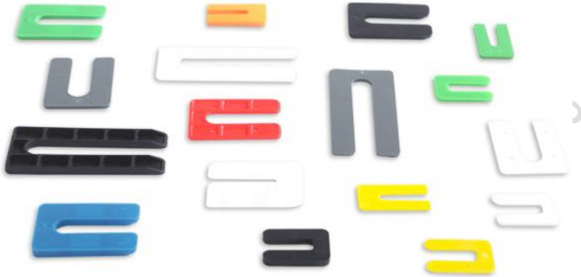
Figure 17: "Horseshoe" installation shims, also known as frame packers 19

Figure 18 shows the location of shims for various window and door types available in the 4500 series. They are generally placed approximately 6" from any corner where load transfer takes place, and under any jamb or mullion. On operating windows, there will normally be an installation hole in this area. When this is the case, it is usually easier to first start the installation screw, and then slip the required shims in above the screw, in between the window frame and the rough opening.